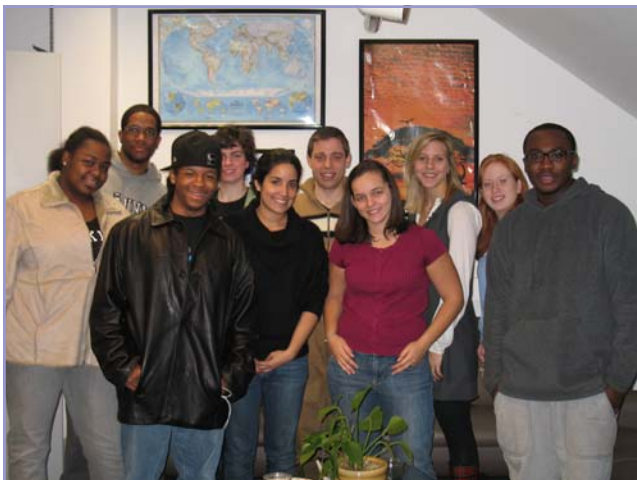
Beginning Kiswahili students pose for a picture on the last day of classes

Tarehe nne, mwezi wa kumi na moja tulipiga kura na Obama alishinda. Watu wengine wanafuraha sana na wengine hawafurahi. Kwa sababu Obama alishinda, tunajua watu wa Marekani wanaweza kusahau rangi ya ngozi ya mtu wanapopigia kura. Lakini, tunatumai watu wa Marekani wanaweza kukumbuka Obama ni mwanaume tu, na atakuwa na kazi kubwa. Anahitaji kurekebisha uhusiano na nchi nyigi za kigeni na uchumi wa nchi yetu.