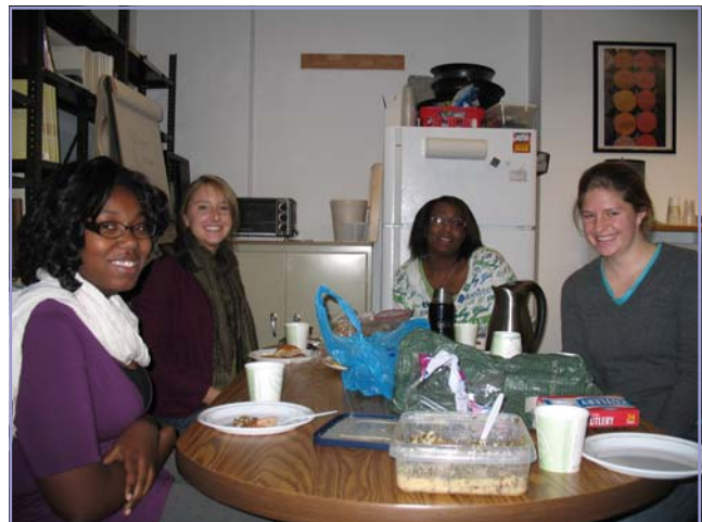
Intermediate Kiswahili class gets together for a special end of the year lunch

On November 4 th , 2008 we voted and Obama won. Many people were very happy and many were very unhappy. Because Obama won, we know that the people of America can forget skin color when they vote. But we hope that the people of America can remember that Obama is just a man and he has a big task. He needs to fix our relations with other countries and our economy.