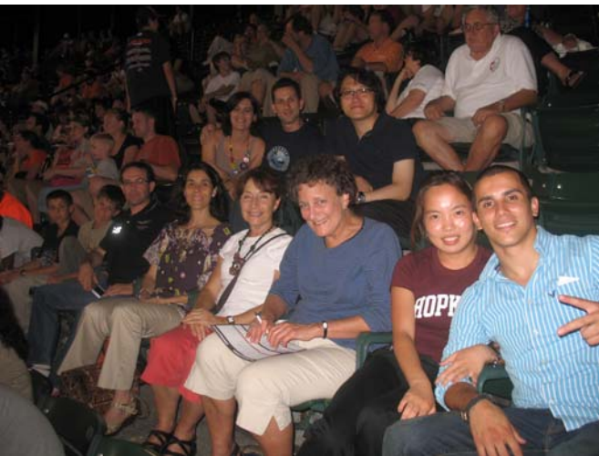
ESL family and friends still smiling even in to the extra innings

After some worry about the weather, students finally settled in to their upper deck seats for a great view of Camden Yards as the Baltimore Orioles faced off against the Toronto Blue Jays.