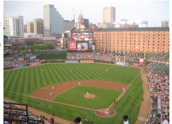
A view of Oriole Park at Camden Yards

The game got tense around the sixth inning as the Blue Jays tied with the Orioles and it didn’t look like the game was going to be