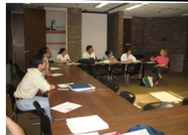
Working hard in Eastern Baltimore

had the opportunity to explore Baltimore and enjoy outdoor activities with their newfound friends.