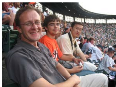
All smiles at the Orioles game

This summer session has proven to be one of the most fun and