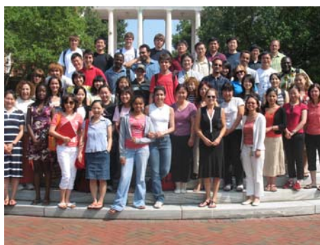
Congratulations Summer 2007 students!