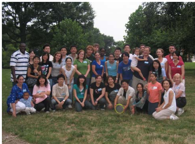
Students with their families and ESL faculty pose for a picture during the annual picnic

The picnic was fun time for students to socialize with other students as well as practice their speaking skills and learn a little about American culture.