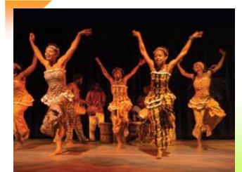
Dance shows during Artscape

For more information on Artscape, please visit www.artscape.org .