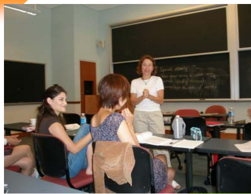
ESL students involved in discussions during class

A whole variety of people for whom English was not their first language wanted to come, so