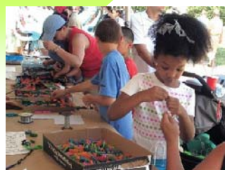
Children enjoying arts and crafts

21st from noon until 9 PM and will run until Sunday, the 23rd until 6 PM.