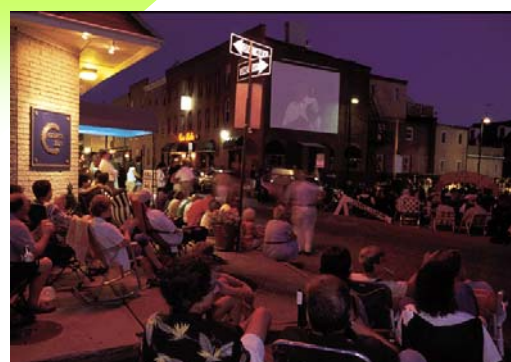
The streets of Little Italy lined with people enjoying an outdoor film screening

The film is free to watch and open to the public, so don't miss out on seeing this classic film!